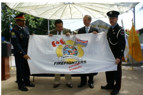
Firefighters Without Borders with BC flag and the Fire Chief of the El Salvadoran National Fire Service

Firefighters Without Borders British Columbia (FWB BC) is a registered non-profit society operating from within British Columbia to provide support to emergency service organizations in countries with a demonstrated need. Our goal is to provide a “helping hand up” to these organizations so that they can provide a higher level of emergency services to their communities.