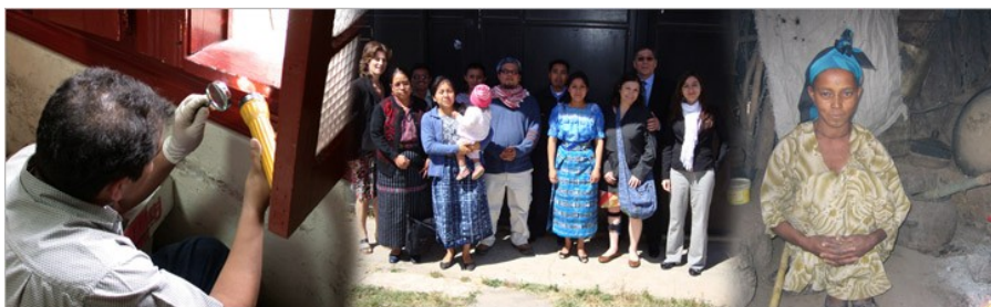
Justice Education Society International Programs